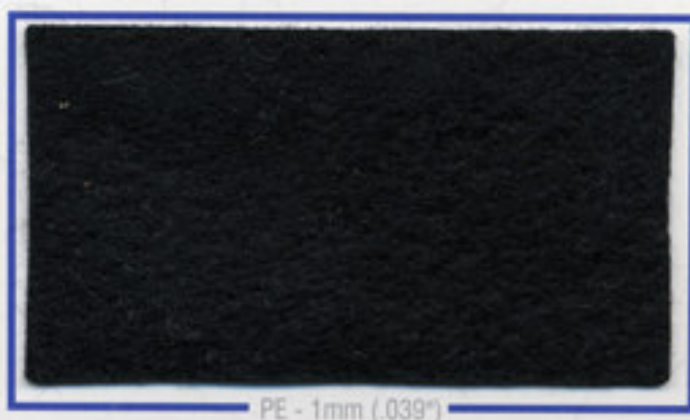
PE - 1mm (.039")