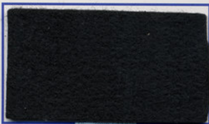
PE - 3mm (.118")