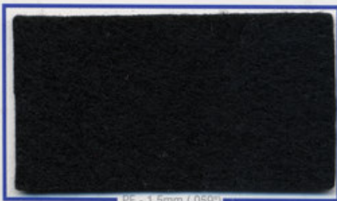
PE - 1.5mm (.059")